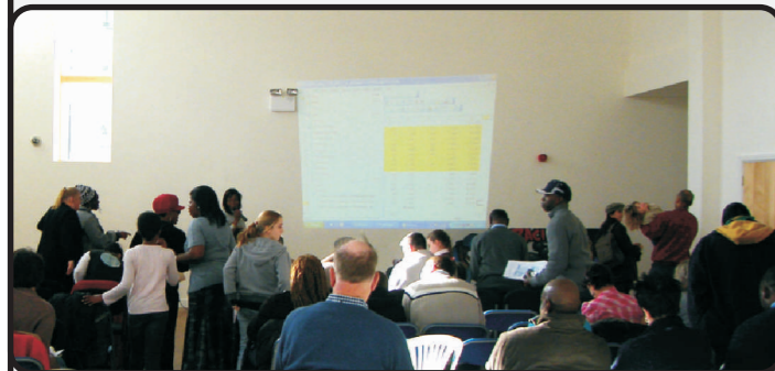
A cross section of participants at a previous Assembly Fund Vote

Please note: No votes will be accepted at 12.45pm. The results will be announced at the end of the meeting.